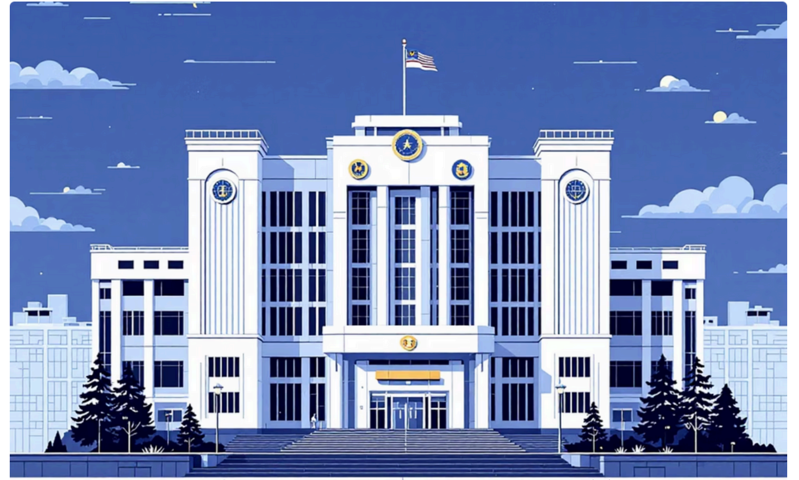
Government, Semi-Govt. & Public Sector