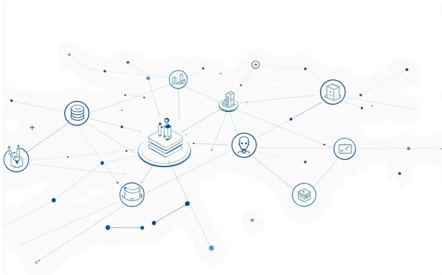
Technology, FinTech & Startups

Our expertise extends to dynamic technology sectors and a diverse range of special entities, providing bespoke financial and advisory solutions to drive success in these un