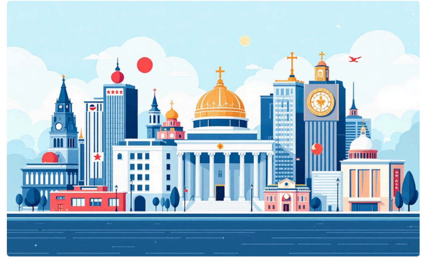
Miscellaneous & Special Entities