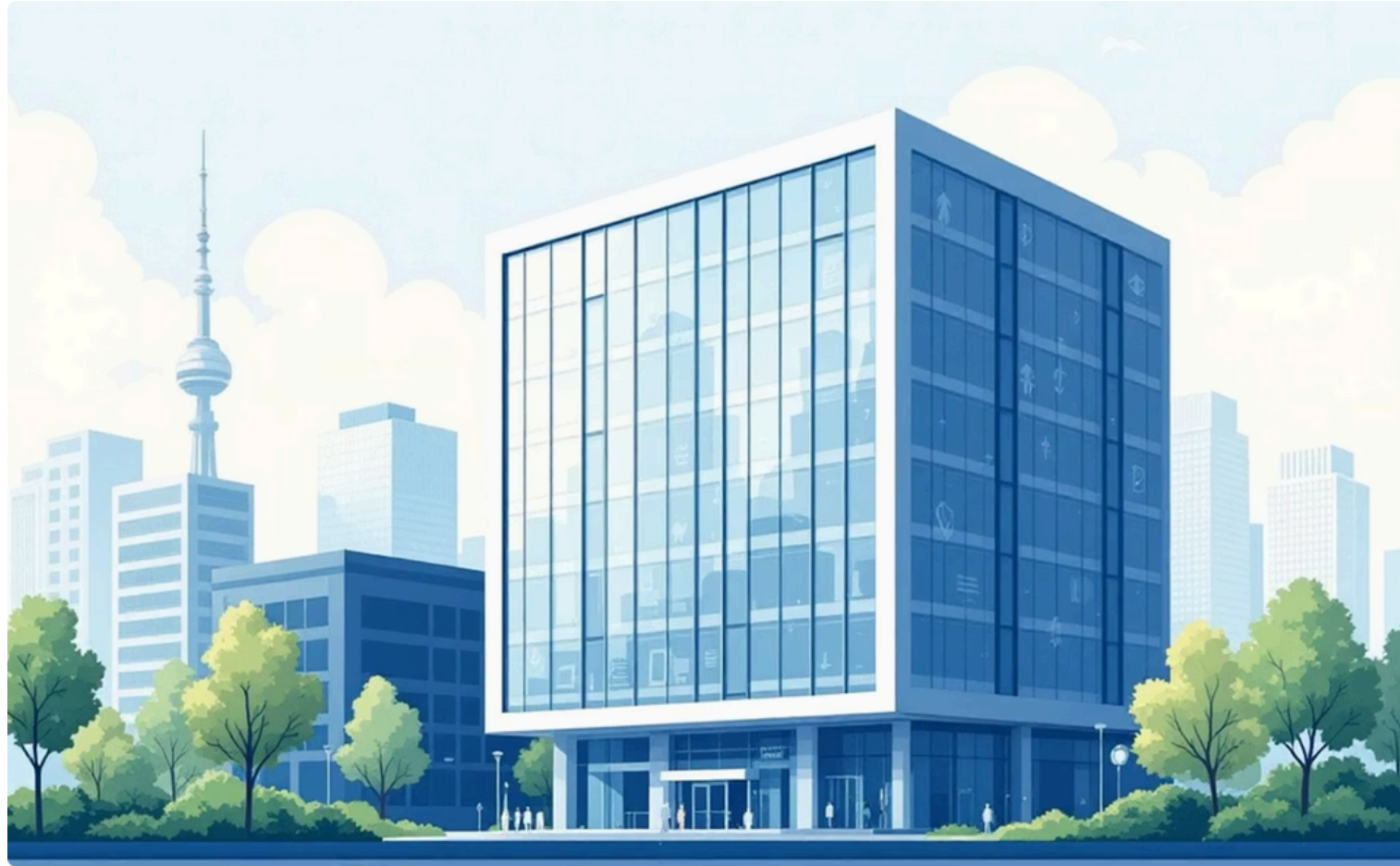
Corporate & Business Entities

Our expertise spans a wide array of corporate, governmental, and public sector entities, ensuring tailored solutions for diverse organizations.